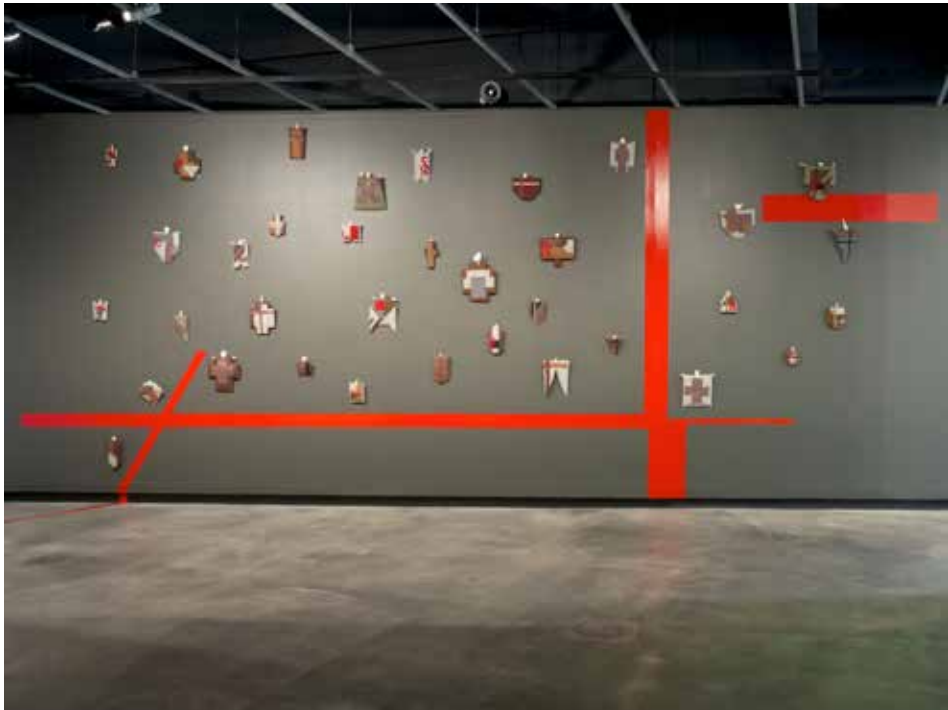
Pat Hoffie (in collaboration with Veronica Sepulveda) Ideology and Artefact #2 2012, silk, plastic, cardboard, Fimo.