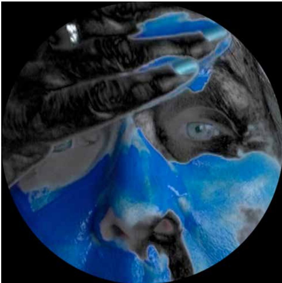
Di Ball BinDi Ball Is Deeply Superficial 2012 (video still), single-channel digital video, 15 min, (looped).