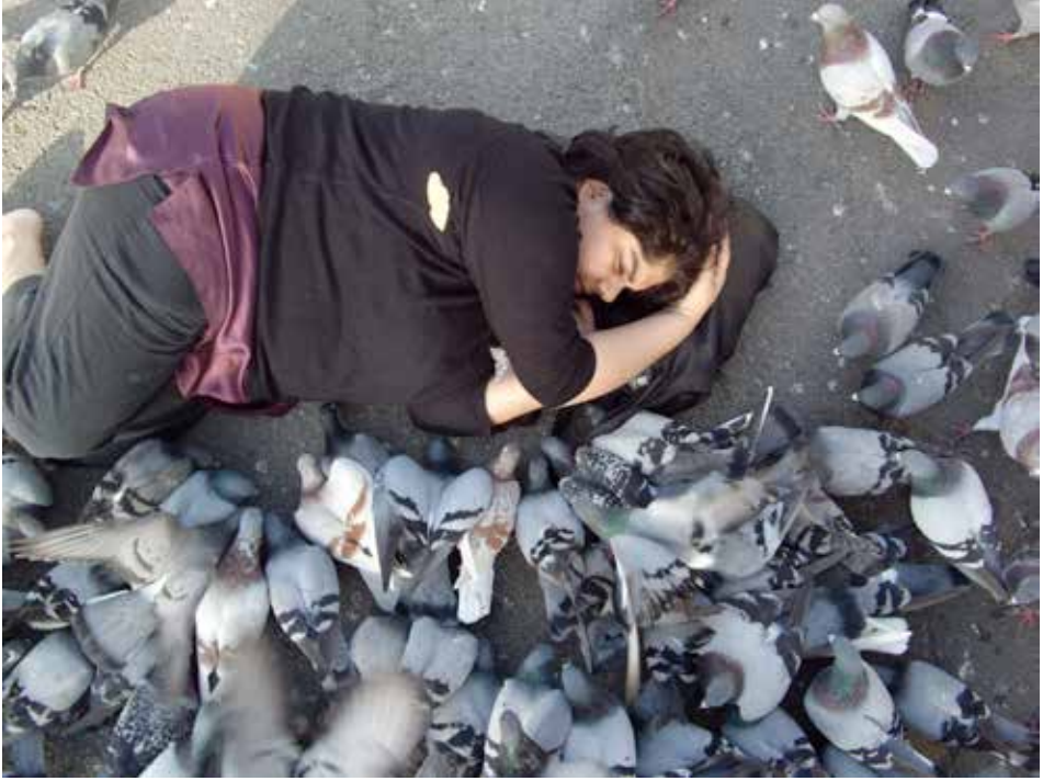
Sonia Khurana Logic of Birds 2006 (video still), single-channel video, 2 min (looped). Image courtesy of the artist.

as landscape". We view the figure with the "logic of birds" in a gendered space that is integrative and inclusive. Khurana describes this portrayal of her body explaining,