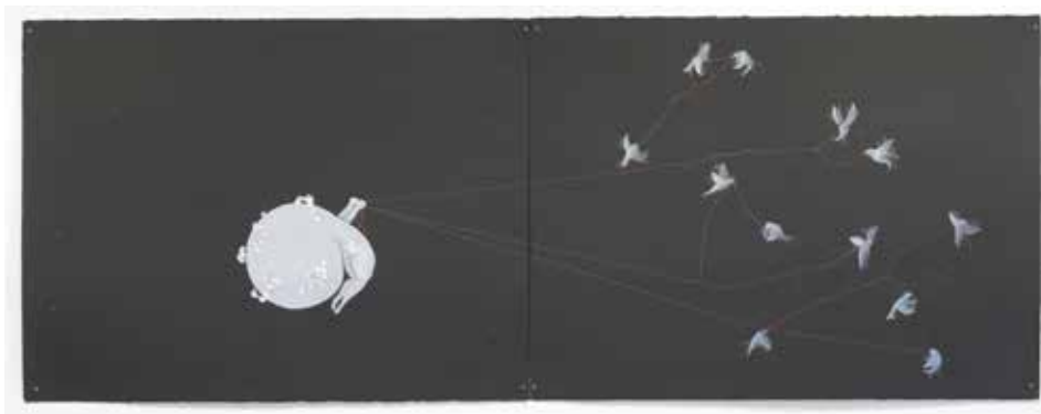
Laini Burton Taking Atlas (Stealth) 2013, diptych: pencil, ink and gouache on paper.