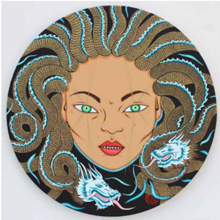
Kate Beynon Transfigured Gorgon (from the Trans-Mythic Woman Warrior series) 2012, acrylic paint and Swarovski crystals on canvas.

historically in history, myth and poetry. "Medusa became the only mortal among three Gorgon sisters. The adjective gorgos (gorg'i) means 'terrible', 'fierce', and 'frightful'." 4 For Beynon, the Gorgon Medusa is cast into the gaze of multicultural Australia and the world. She is a hybrid figure capable of seeing and perceiving; she has the power to meet that gaze, to deconstruct, to subsume and to overthrow objectification, misogyny, and all forms of prejudice/discrimination/hatred with anti-bigotry powers that "turn only bigots to stone". In this phrase and gesture, the artist reveals the racist potential in contemporary life. Transfigured Gorgon may symbolically represent the migrant or the sub-altern, or any marginalised hybrid being, whose very existence is as threatening, "terrible, fierce or frightful" as the mythical Medusa, to those in society frightened by the experience of "other",