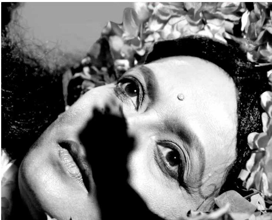
Pushpamala N. Indrajaala/Seduction 2012 (video still), from the series Avega—The Passion: The Drama of Three Women , single-channel digital video, 4:27 min (looped).

transforming archetypes like the “Native South Indian woman”, the “Magician”, the “Warrior”, the “shaman”, the “Femme Fatale”, the “Noble Savage” and the “Whore”, altering the historical and popular symbolism assigned to the infamous villain Surpanakha and accomplishing a re-telling of the Ramayana from a distinctly feminine perspective.