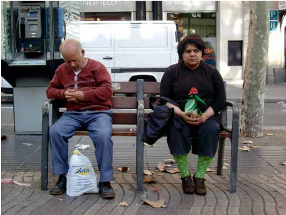
Sonia Khurana Flower Carrier III 2006 (video still), single-channel video, 10 min (looped).

would call her: the crazy woman with the forget-me-not. 5