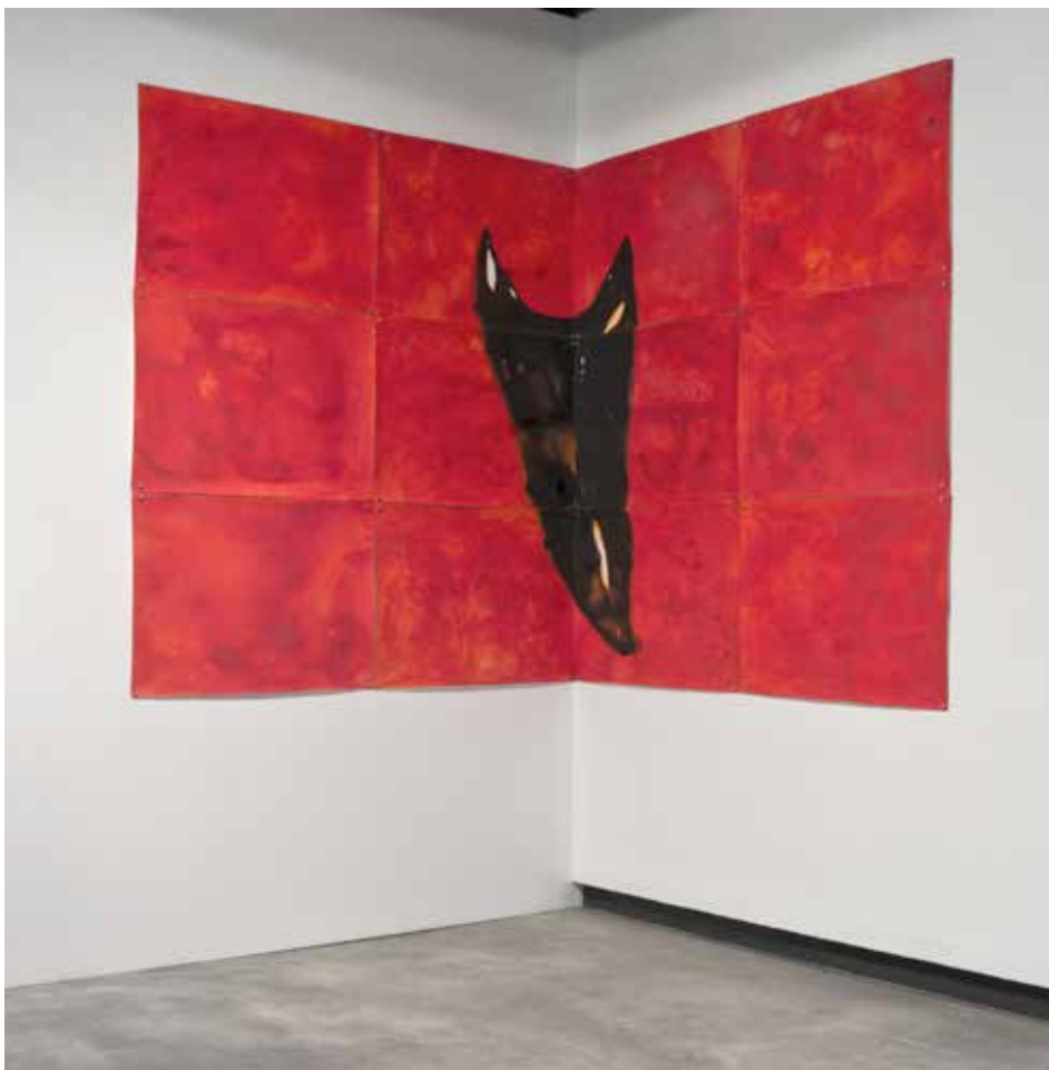
Shambhavi Red Kali 1997, watercolour on handmade paper, 12 sheets.

through the assignment of the foreboding tongue, a tool for peace and a weapon against violence. The Hindu Goddess Maha Kali is visually transfigured in Shambhavi's work, a metaphor for the wider potentials for violence in humanity.